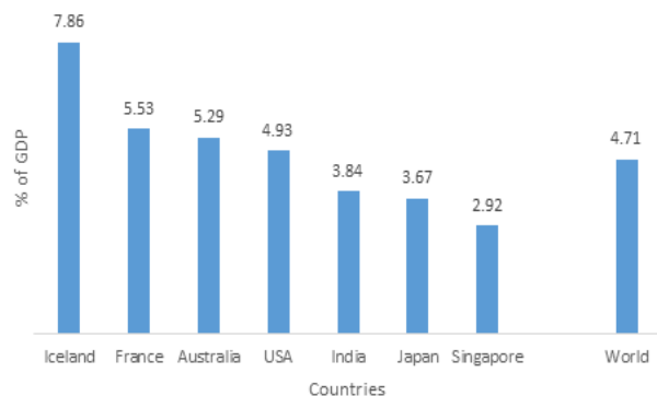
Figure 1. Expenditure on education as percentage of GDP of India compared with some developed countries and world average.

Thus, agricultural education in India is not for producing professional farmers. There are close to 14 crore agricultural land-holdings in the country. So, at least that many households can be called farming households. Even if we consider one child from each household to get agricultural education, it will take centuries of agricultural education at the current enrolment rate. If we want professional farmers, we need to strengthen the agricultural education infrastructure substantially. Therefore, the statement viz. –‘agricultural graduates do not practice agriculture’ is not well-founded. Agricultural education is for producing professionals who can intervene in the farming process through various employments (research and development, manufacturing of inputs, marketing of inputs, catalysts for adoption). By creating more and better opportunities in the above mentioned main agricultural sectors, it is possible to persuade agricultural graduates from opting for other fields like civil services and banking.