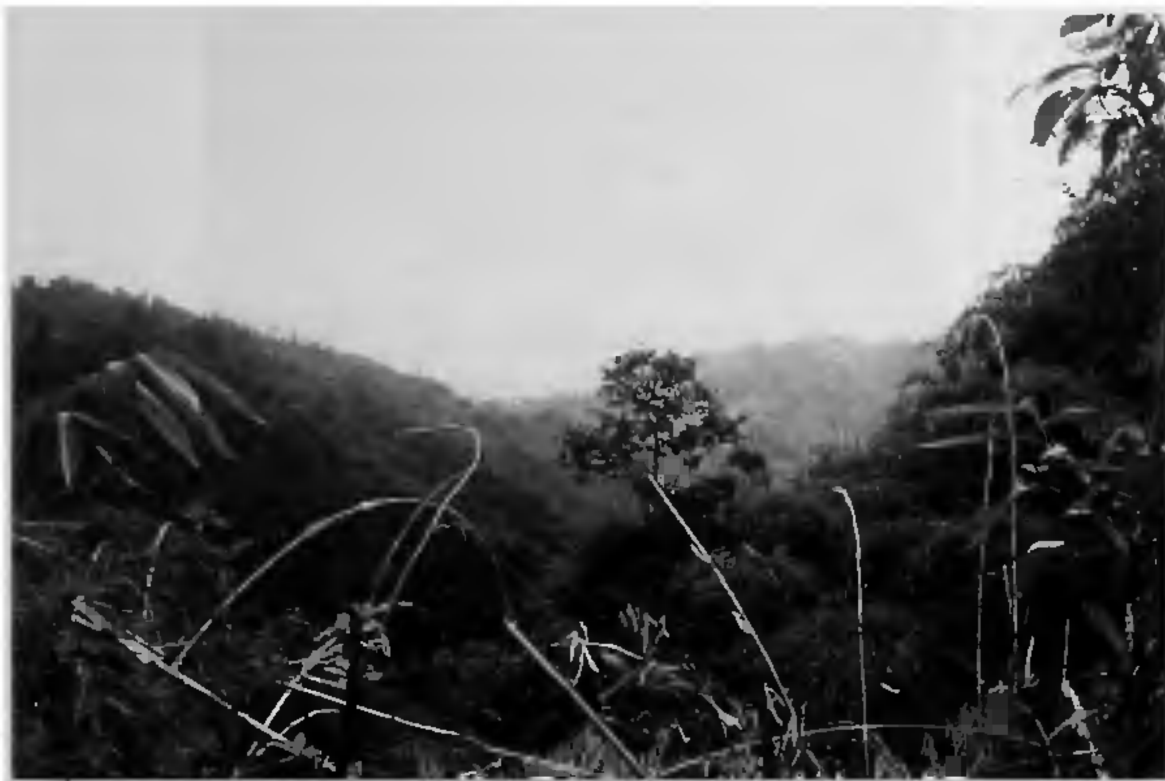
Figure 1. A view of high altitudinal ranges in Arunachal Pradesh.

The site 2 resembles site 1 except that the sandstonic bedrock, relatively near the surface, is almost exposed