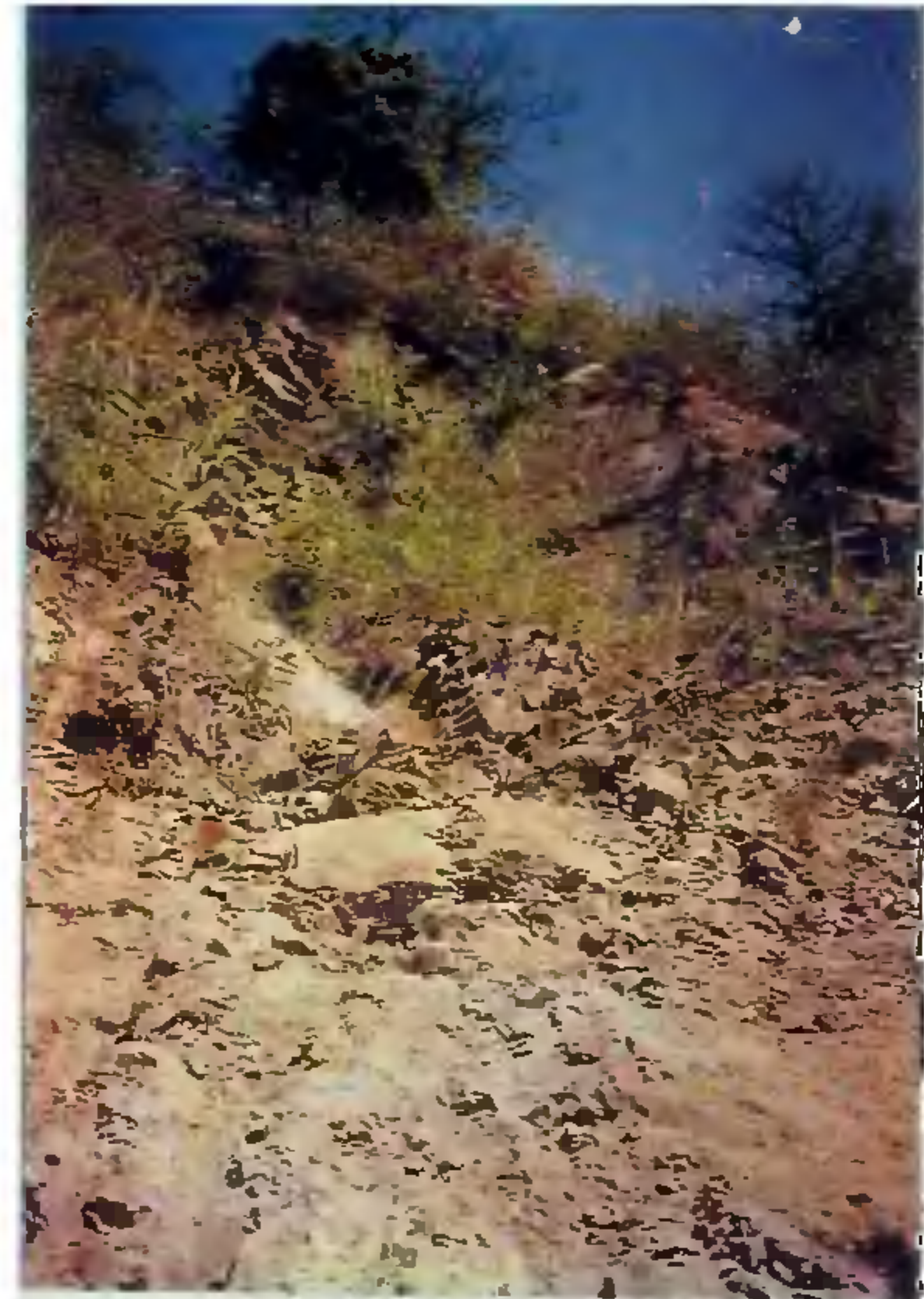
Figure 6. Still closer view showing destruction of natural vegetation due to severe soil degradation.