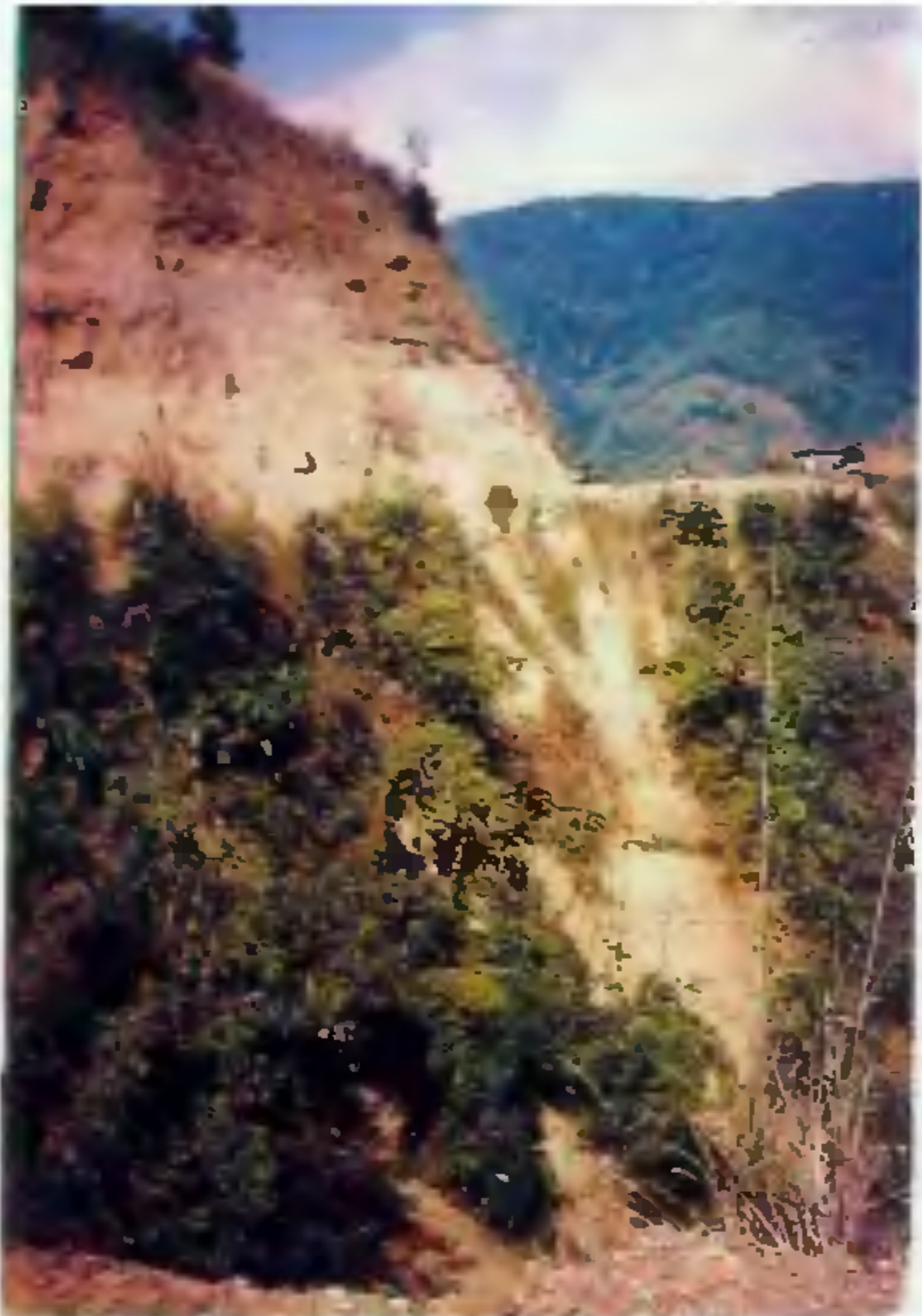
Figure 4. Huge sandstonic rock mass in advanced stage of weathering causing continuous erosion near the river, Daimukh: the rounded pebbles carried by the river from the high hills of the Himalaya.

drip or litter decomposition (Table 2). The dithionite-extractable iron (Fed) values in Pedons 1 and 2 show little variation within the profiles and may indicate less weathering. It appears that higher Fed values are due to higher iron content of the bedrock and do not indicate a greater weathering intensity. This is amply proved by