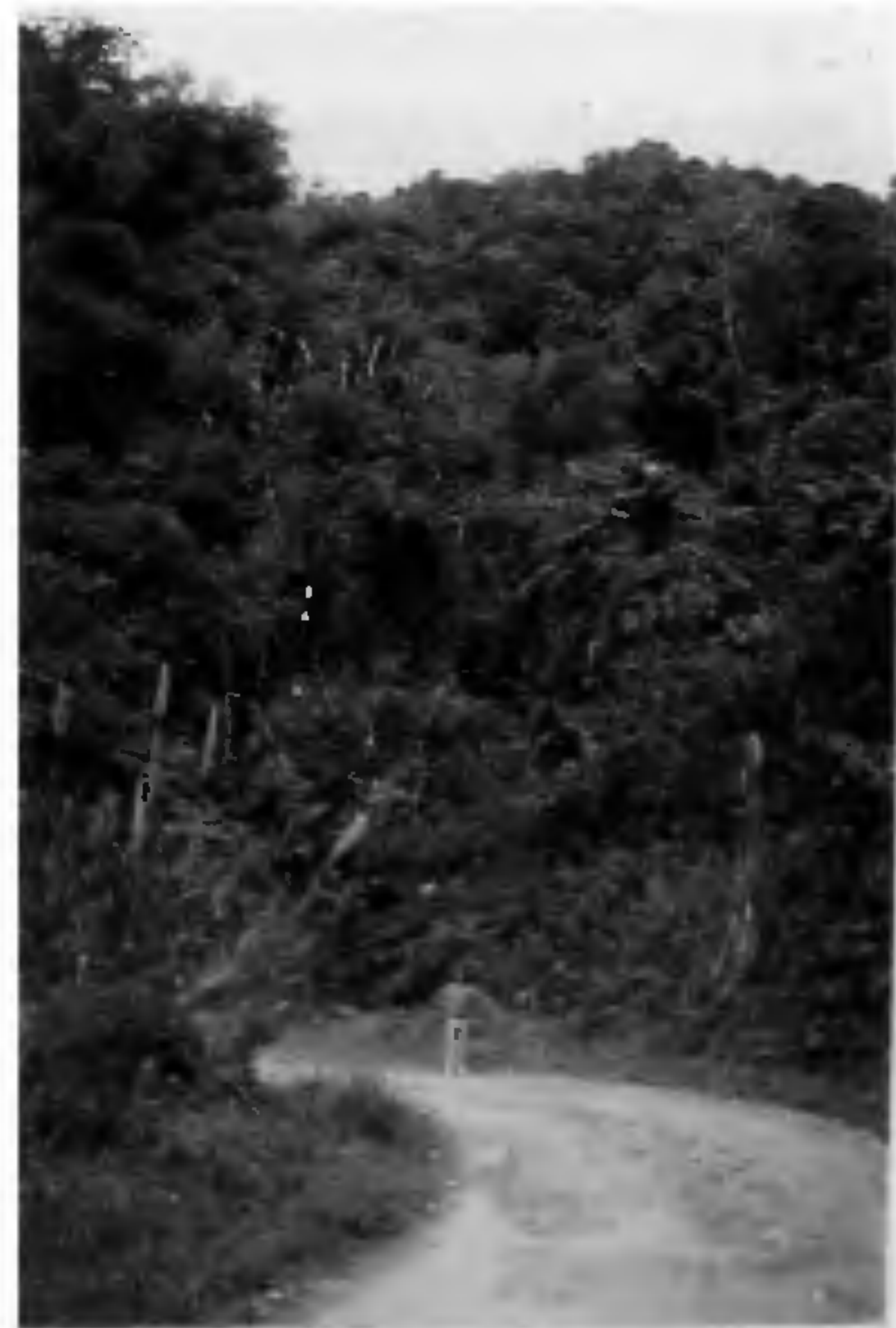
Figure 3. Luxuriant vegetations of different forest species of high altitude banana and bamboo (SW of site 1 about 8 km NW of Duimukh, district Papumpoma, Arunachal Pradesh).

to the weathering. The profile represents a side slope of the steep hills which are thickly covered by shrubs and mosses. Beneath it are highly weathered sandstones. The difference between C1 and C2 appears only as the degree of weathering and that C1 is slightly more reddish. The morphology of Pedons 1 and 2 (Figure 1) as well as depth distribution of sand and silt fractions on clay-free basis and the sand and silt ratios (Table 1) indicate lithological discontinuities 7 . A noticeable characteristic of Pedons 1 and 2 is a relatively higher content of sand (0.1–2 mm). It is obvious that at sites 1 and 2 the weathering of sandstone has given rise to high amount of sands in these two soils (Figure 4). The distribution of (clay-free) sand and silt fractions and their ratios (Table 1) point towards parent material uniformity in Pedon 3. Such homogeneity discounts clay enrichment of the B horizons caused by sedimentation. In view of the uniformity of the parent material, the clay distribution as a function of depth clearly indicates that these soils are fairly well developed. This is in accordance with the views of Barshad 8 , who indicated that in a fairly well-developed soil, as a result of pedogenic processes, the clay content increases with depth to attain a maximum and then decreases until it remains constant or completely disappears. In Pedon 3, the clay content, however, decreases after attaining a maximum value of 475 g kg -1 at a depth of 115 cm.