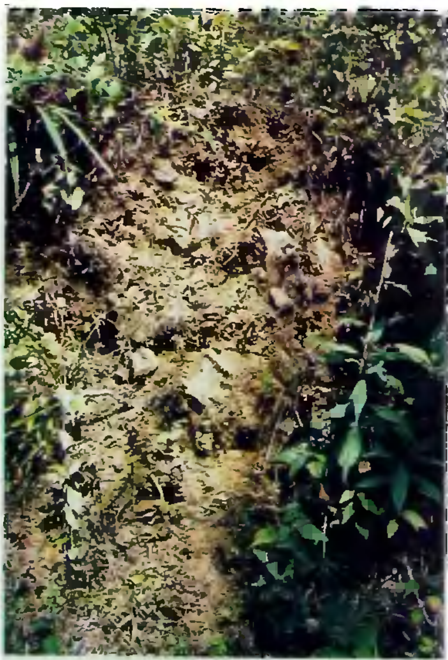
Figure 5. Degradation of soils and landscape: severe soil erosion affecting landscape stability (site 2, about 22 km SE of Kheel, district Papumpoma, Arunachal Pradesh).