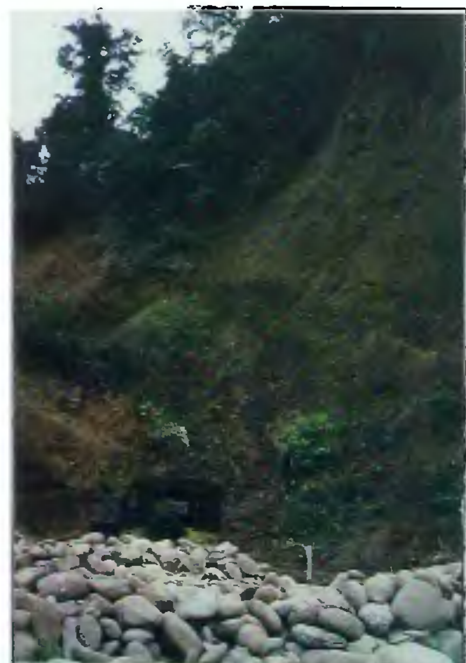
Figure 7. High degree of erosion near the site 3 causing truncation of top soil layers (near Itanagar).